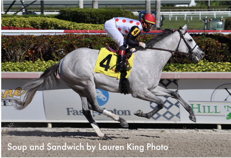
Soup and Sandwich