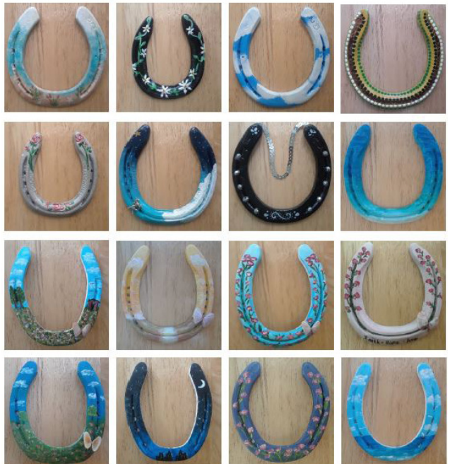
Some of the painted horseshoes up for auction.

This fundraising event will benefit the College of Central Florida Equestrian Club. All money raised will go to providing students the opportunity to attend events or participate in activities relating to the equine industry. For further information or to make a donation, contact Frenchie at (352) 216-4273.