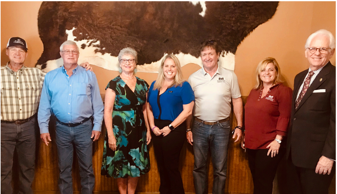
Southern Pig & Cattle Restaurant Grand Opening - August 10, 2020

A new Southern Pig & Cattle Restaurant is now open at 4433 SE Maricamp Road. Come check out their new Ocala location and try some of their award-winning barbeque.