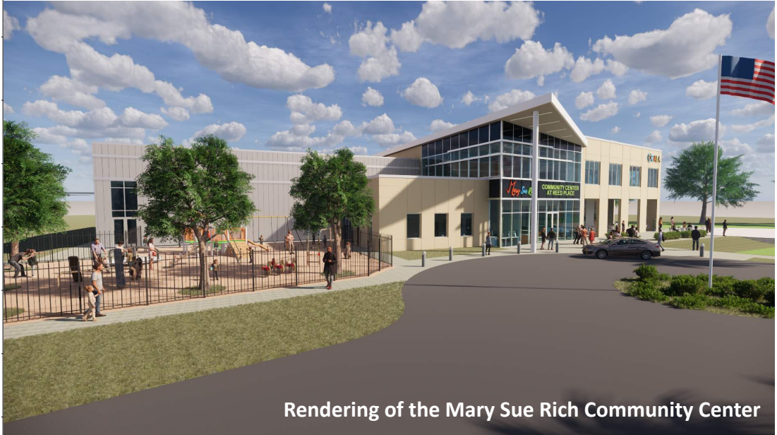
Rendering of the Mary Sue Rich Community Center

As part of the revitalization efforts in West Ocala, plans for the Mary Sue Rich Community Center are moving along. The new 41,750 square foot, two-story center will serve as the hub of the community. The building will include designated indoor space for senior, youth and family programs; a banquet/event space; fitness equipment and indoor walking track; two full basketball courts; a library and multi-purpose studio rooms. Future plans include adding outdoor spaces, an outdoor playground, event lawn and community garden. The expected completion date is spring 2022.