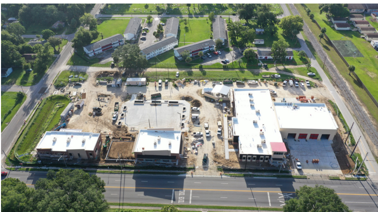
Construction at the MLK First Responder Campus

Construction continues at our new First Responder Campus. The facility is located adjacent to the Croskey Commons special district and is proposed to interconnect with the special district to enhance the area. The campus will feature community rooms, a basketball court and social gathering spaces to promote greater interaction with the community.