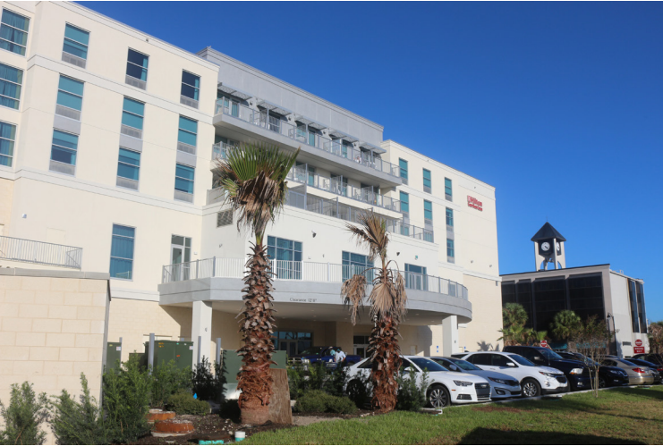
Front View of Hotel

coming to the Ocala area. Previously, the downtown area was home to the Marion Hotel however it has not been operational for decades; the addition of this hotel will now provide accommodations in the middle of Ocala and a unique guest experience. The new Hilton Garden Inn will overlook the historic downtown square, feature an on-site restaurant, and the future completion of a food hall on the first floor.