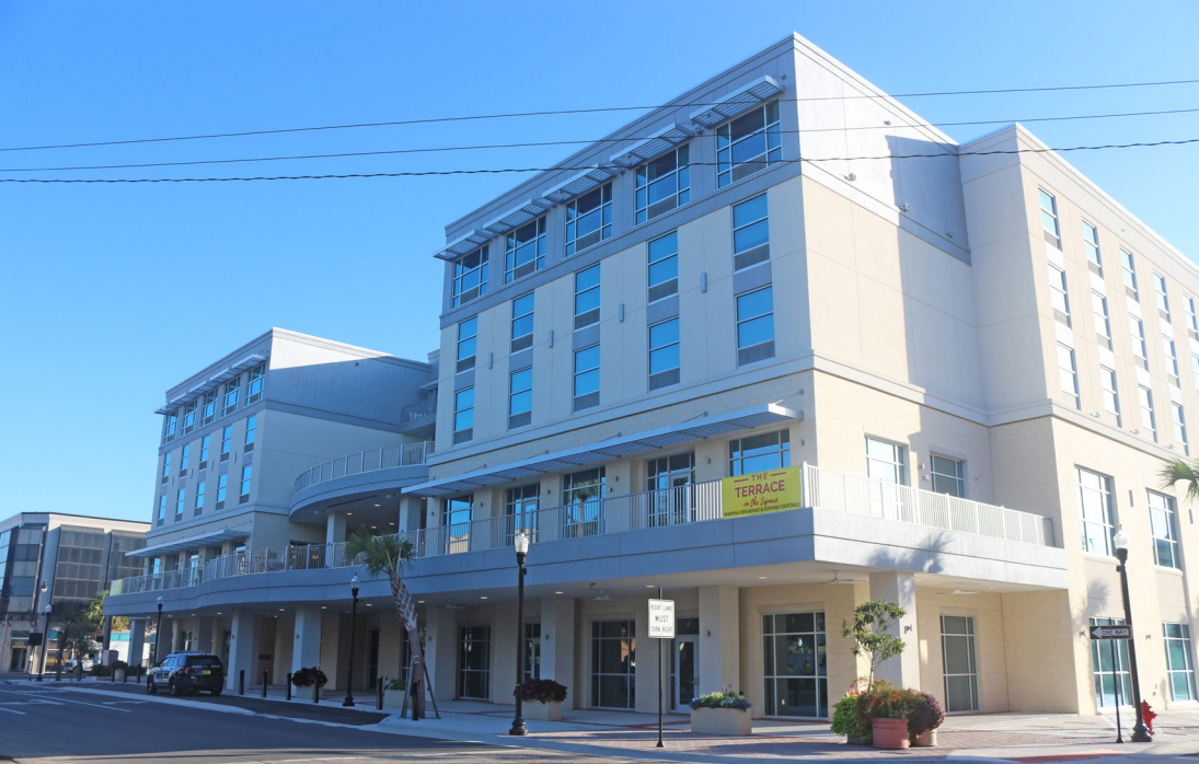
Rear View of Hotel