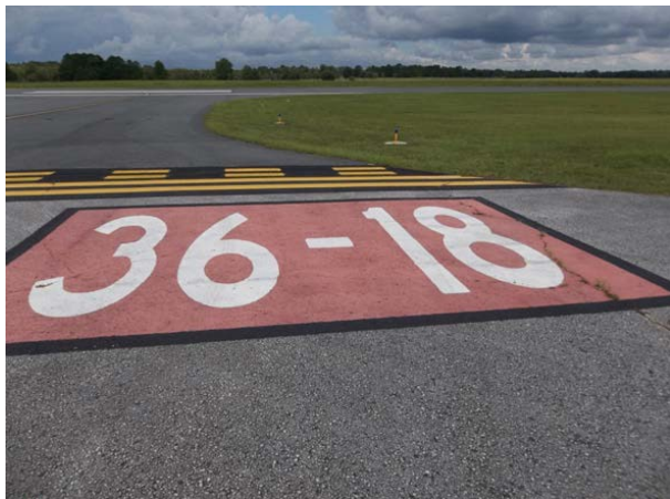
(Surface Painted Runway Hold Sign & Marking)