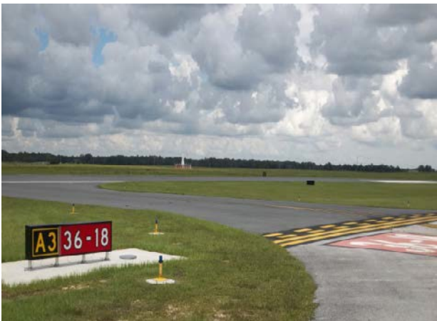
(Runway Hold Sign & Markings)